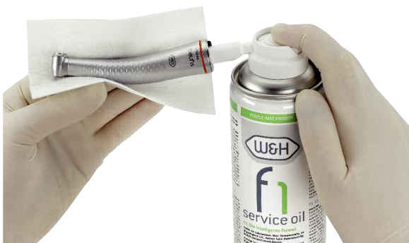
W&H Service Oil F1 in the MD-400 spray can.