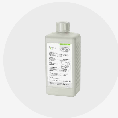
Bottle for Assistina