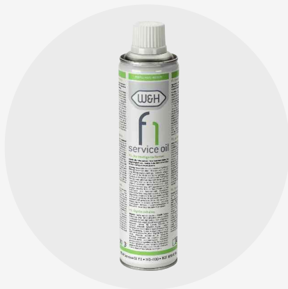
Oil spray can

Diagrams, symbol photos, additional equipment and the content of illustrated accessories do not form part of the scope of supply.