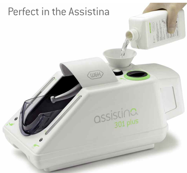
W&H Service Oil F1 in the MD-500 bottle for use in the Assistina.

W&H dental drives achieve top speeds of up to 390,000 r.p.m. F1 provides excellent lubrication